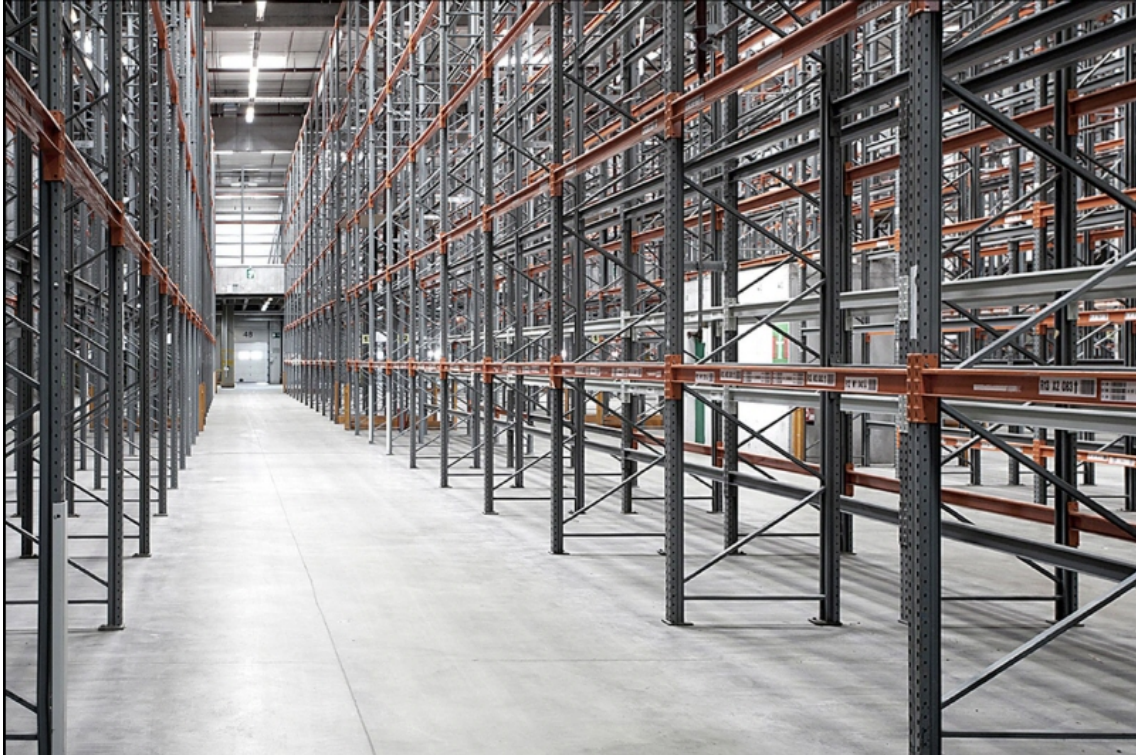
Innenansicht Halle 2